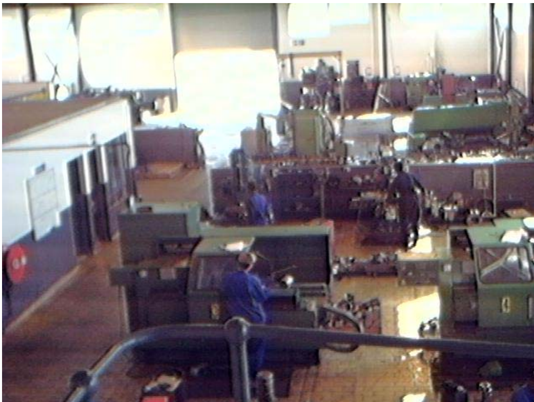
A view across our workshop