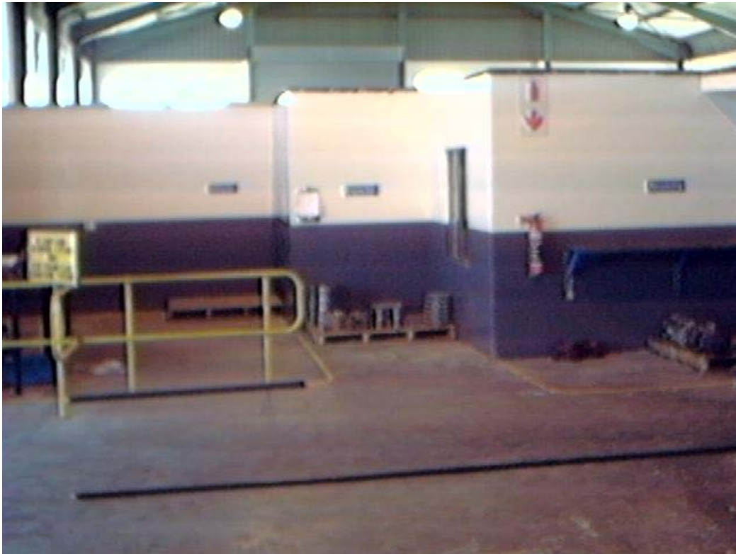
Our inspection area

We follow the principles and procedures of SABS 0157 / ISO 9002 and are working towards registration.